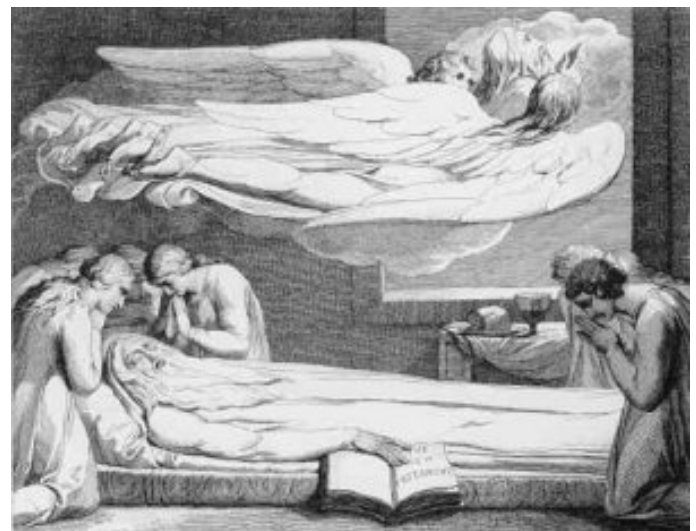
The soul of a good old man leaves him at the moment of death and is borne away by angels to Paradise.

When one considers the dying-brain account in its full context it is clear to see that the emphasis placed on cerebral anoxia misses the true essence of the account. As a consequence, many of the criticisms against the dying-brain hypothesis border on the irrelevant. For the dying-brain account, the central assumption does not revolve around the presence or absence of anoxia per se, but of neural disinhibition. So the dying-brain hypothesis is perhaps more accurately characterised as one that models NDEs as an experiential consequence of a disinhibited brain (Blackmore, 1996, 1993, 1992, 1990; Braithwaite, 1998; Carr, 1982, 1981; Jansen, 1996, 1990; Saavedra-Aguilar & Gomez-Jeria, 1989; Woerlee, 2003). Of course, such neural disinhibition can be induced by anoxia, and it is likely that under more prolonged near-death situations it is likely to be present but, as a process, disinhibition can actually be triggered by many psychological and neurological factors such as confusion, trauma, sensory deprivation, illness, pathology, epilepsy, migraine, drug use and brain stimulation (for comprehensive reviews, see Appleby, 1989; Baldwin, 1970; Blackmore, 1993; Sacks, 1995; Siegal, 1980). Without exception, all these instances that induce neural disinhibition and seizure-type activity can all be associated with aura and hallucination.