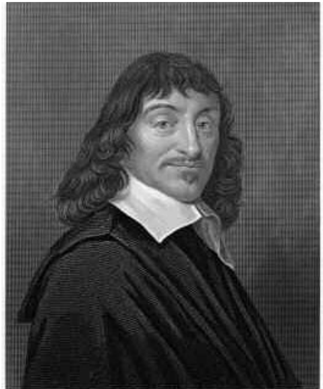
Rene Descartes' name will forever be associated with the concept of dualism but it has yet to be proven that the mind can be separated from the brain